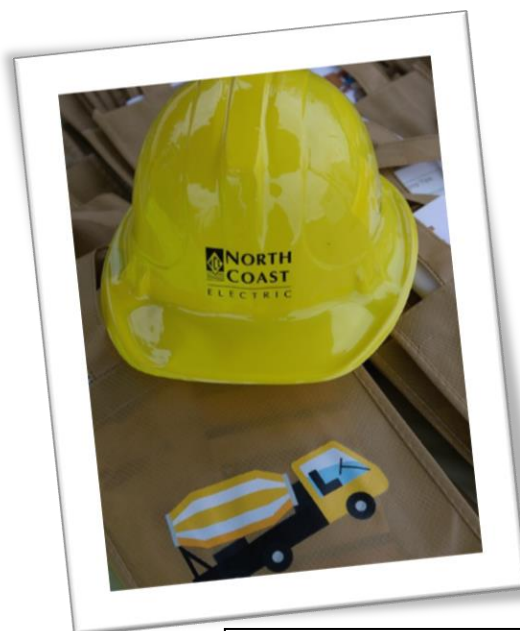
2018 Hard Hat Sponsor, North Coast Electric